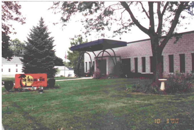
School building →

The class sizes are kept to a maximum number of participants, which allows for the small class size and a more personal and relaxed learning environment. Applicants must have a degree and a current license in good standing (see application form and the section discussing specific requirements). Please note that all of the patients being evaluated and used during labs are either from owners who have volunteered to help the students learn, and get the reciprocal benefit of low-cost care for their companions or from rescue facilities that have removed the animals from abusive homes, and that will benefit from the specific health care modality, and from some tender loving care that they deserve.