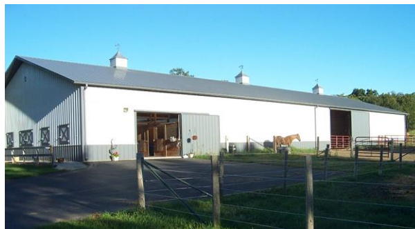
One of the lab facilities→