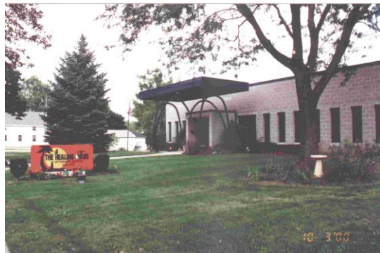
School building →

The class sizes are kept to a maximum number of participants, allowing for small classes and a more personal and relaxed learning environment. Applicants must have a degree and a current license in good standing (see application form and the section discussing specific requirements). All patients evaluated and treated during hands-on practicums are private owners or rescue facilities.