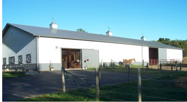
One of the private facilities used by the school