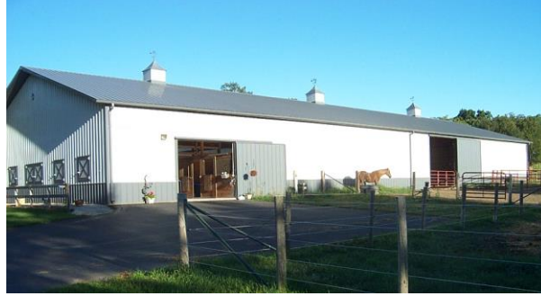
One of the private facilities used by the school